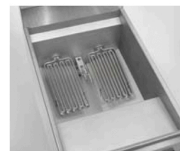
Immersed element models are the lowest cost alternative for electric fryers.