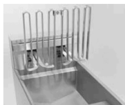
Tilt-up elements provide full access to the frypot for cleaning.