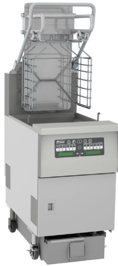
SFSELVRF Shown with K12 computer, 9" front / rear casters