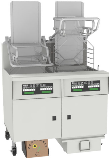
SELVRF DUAL Shown with K12 computer, 9" front / rear casters

SELVRF SOLSTICE ELECTRIC REDUCED OIL VOLUME RACK FRYER