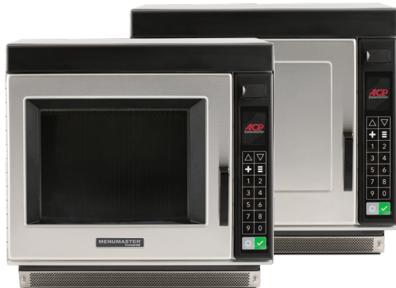
Left to right: MRC window door style and MRC solid door style (*S2D)