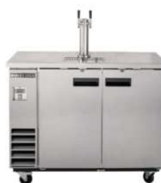
MXBD48-1SHC 47.5"W x 24.4"D x 56"H