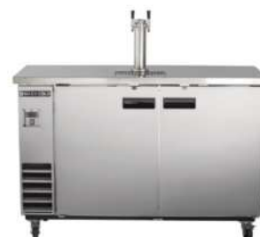
MXBD60-1SHC 61.06"W x 24.4"D x 56"H