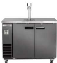
MXBD48-1BHC 47.5"W x 24.4"D x 56"H