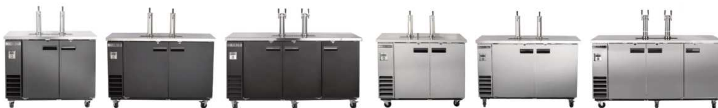
MXBD48-2BHC 47.5"W x 24.4"D x 56"H