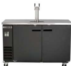
MXBD60-1BHC 61.06"W x 24.4"D x 56"H