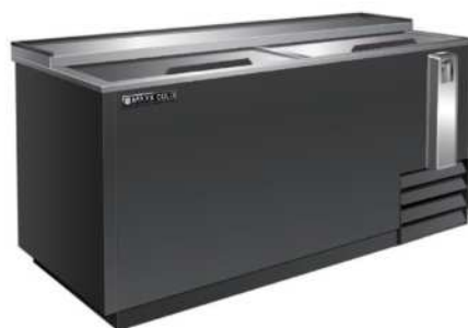
MXCR65BHC 64.3"W x 27"D x 35"H