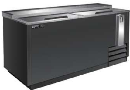
MXCR50BHC 49.4"W x 27"D x 35"H